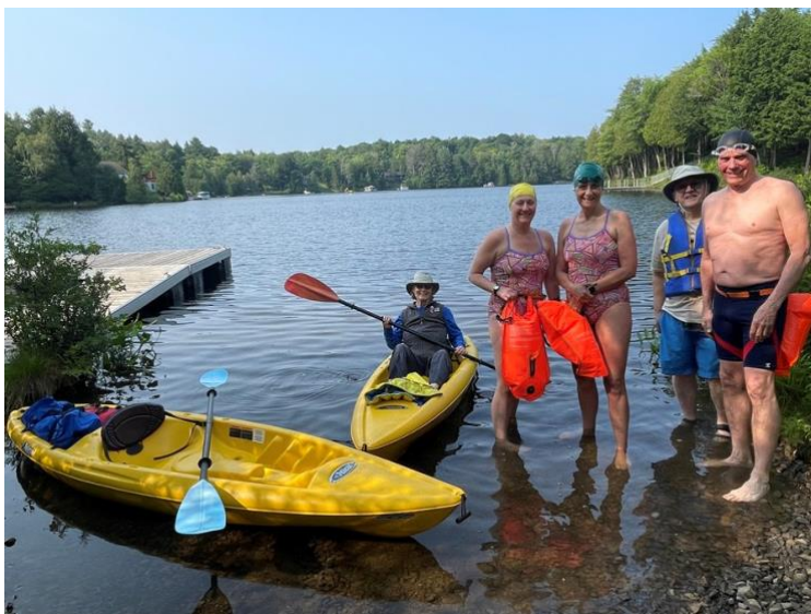
Participants prepare for start of East-West Crossing 2024

If you are looking for information on the Municipal Regulations for Gore, please consult the Gore website. https://www.cantondegore.qc.ca/en/publications/rules