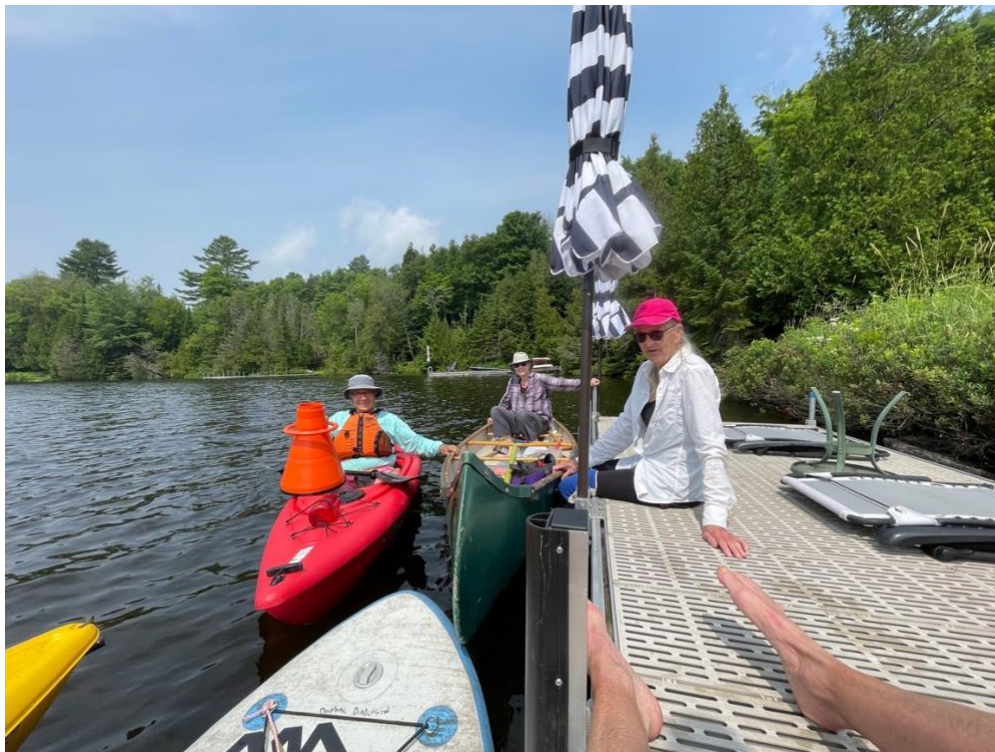
Plant Survey Volunteers 2025